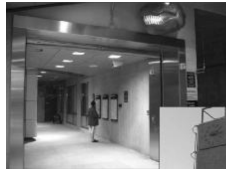
Head House at Bergenline Avenue

The station platform is 300 feet long and can accommodate three vehicles. About 70% of the Tunnel is lined. The remaining section retains the natural rock face.