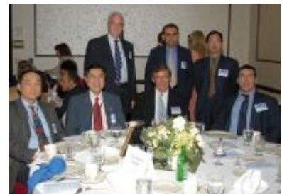
Washington Group Table