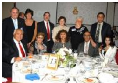
Table 13: Schoor DePalma