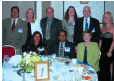
Table 1: South Jersey Branch