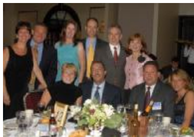
Table 12: PMK Group