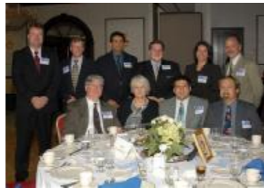
Table 2: North Jersey Branch